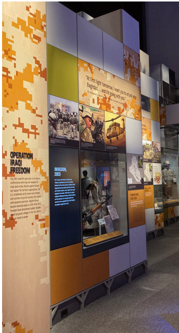
Exhibit areas like Operation Iraqi Freedom (left) showcase the experience of the American Soldier during conflict.

The Changing World Gallery chronicles one of the most dynamic and global periods in U.S. Army history, from the fall of the Soviet Union through our nation's most current conflicts. The Global War on Terror portion follows the progression of operations in both Afghanistan and Iraq. The theme, Changing World, sets up an interesting dichotomy indicating that while the last two decades have been a time of near-constant conflict, it is the individual Soldier who must, as always, endure the challenges of war.