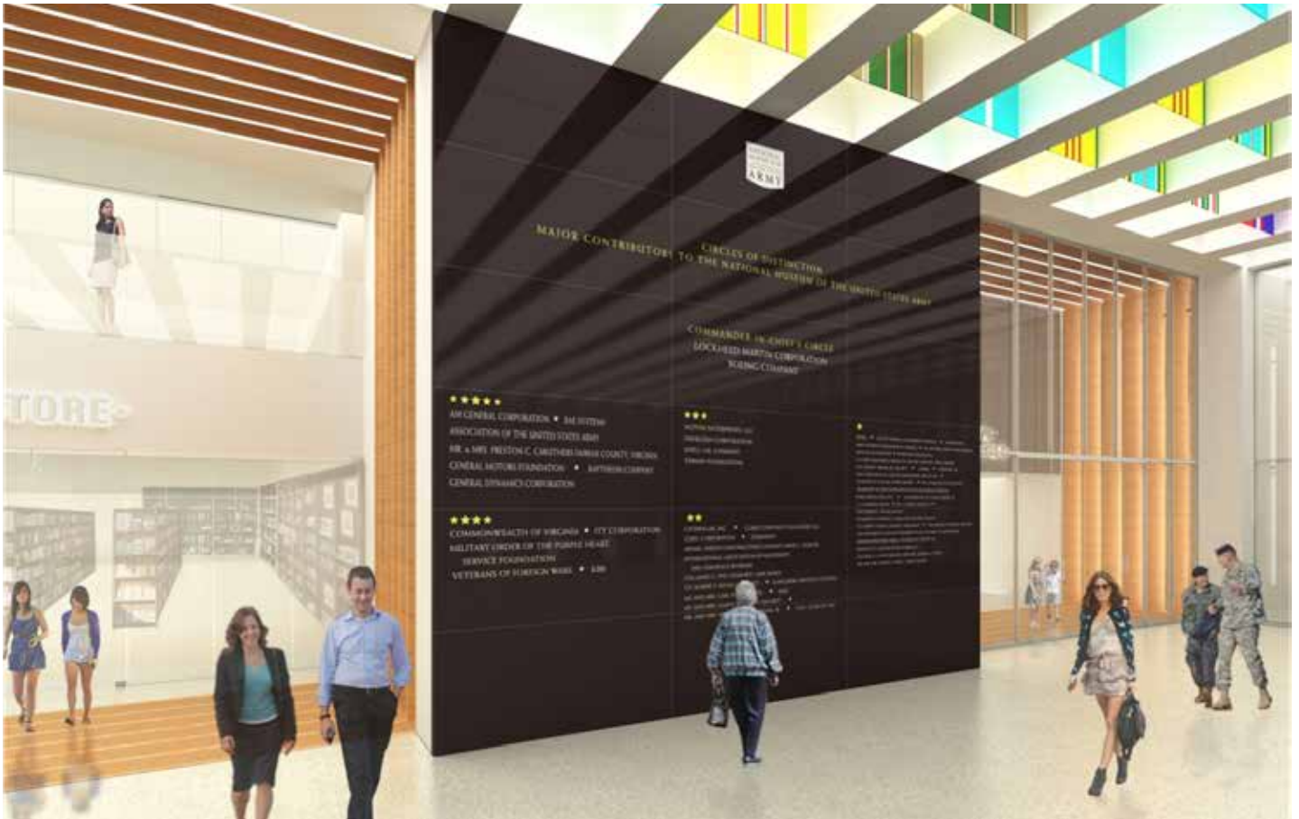
Finished Donor Wall Rendering—Flanked by Gift Shop (left) and Experiential Learning Center (right)