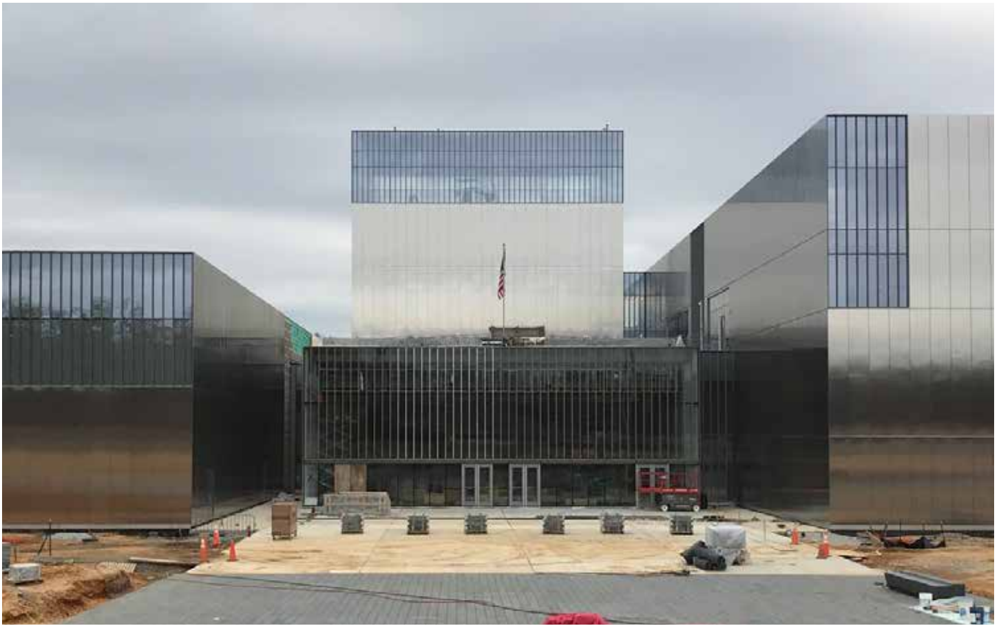
Museum Entrance-November 2018