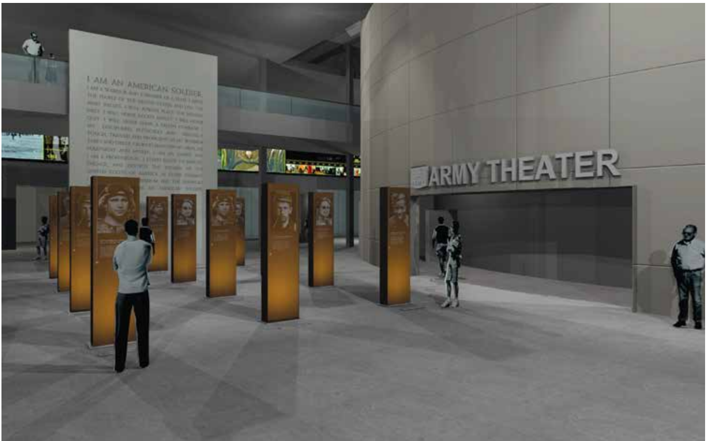
Finished Soldiers Stories Gallery and Army Theater Conceptual Rendering