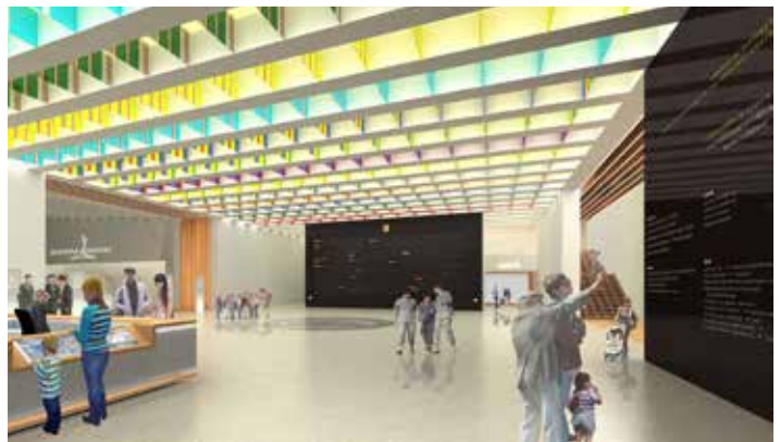
Rendering of the finished lobby of the NMUSA with the Army Emblem at the far end.