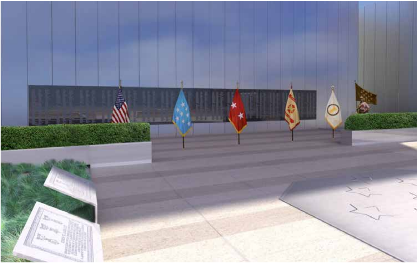
Finished Medal of Honor Wall Conceptual Rendering