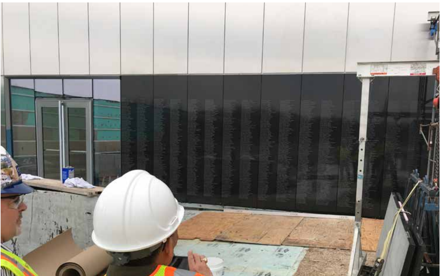
Medal of Honor Wall-November 2018