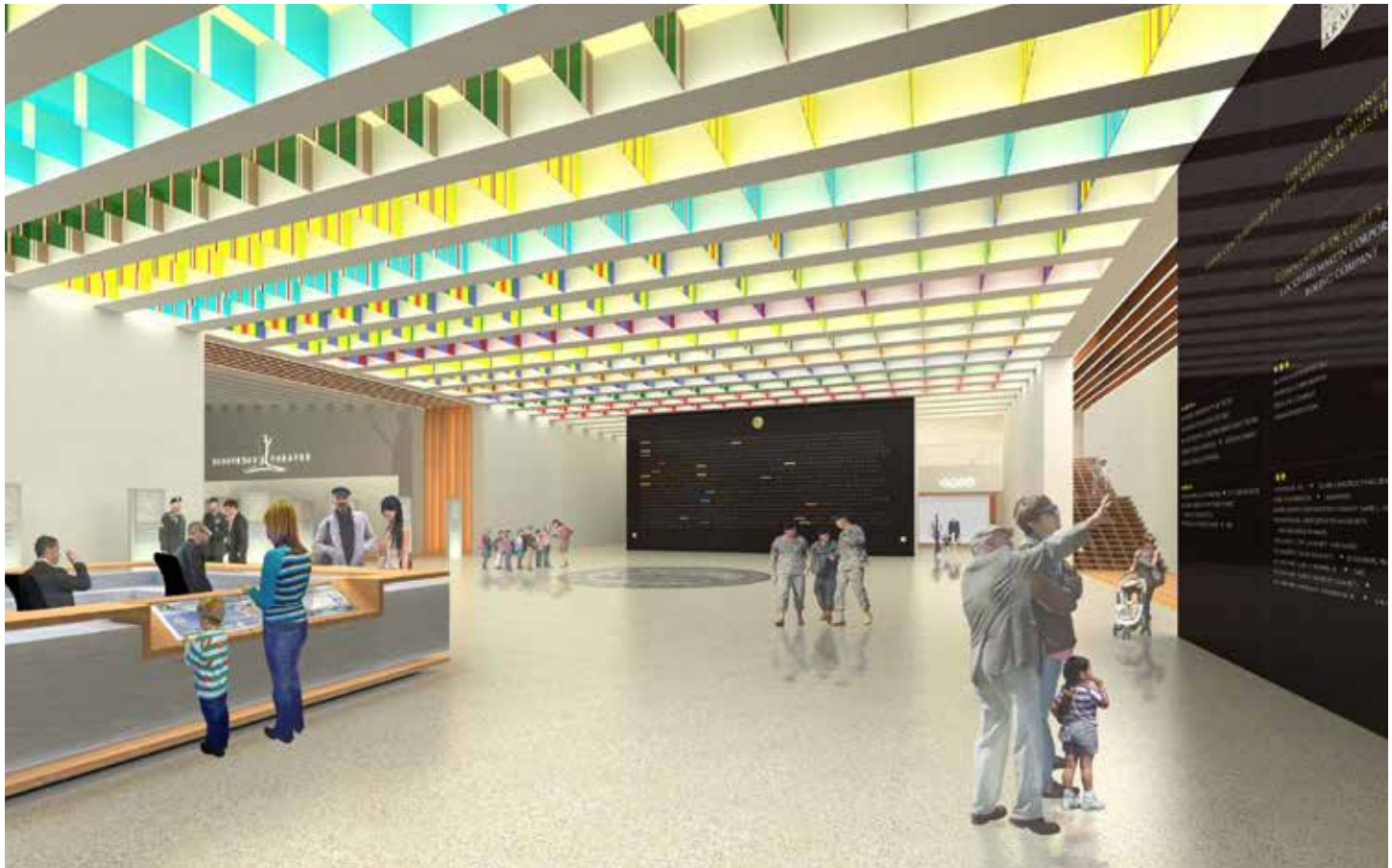
Finished Lobby Conceptual Rendering with Army Seal. Army Theater at left of the Seal.