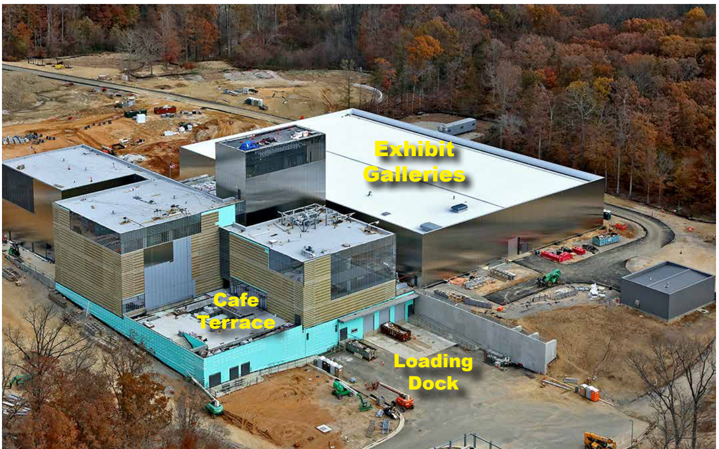
Aerial Photo of the National Army Museum Site-November 2018