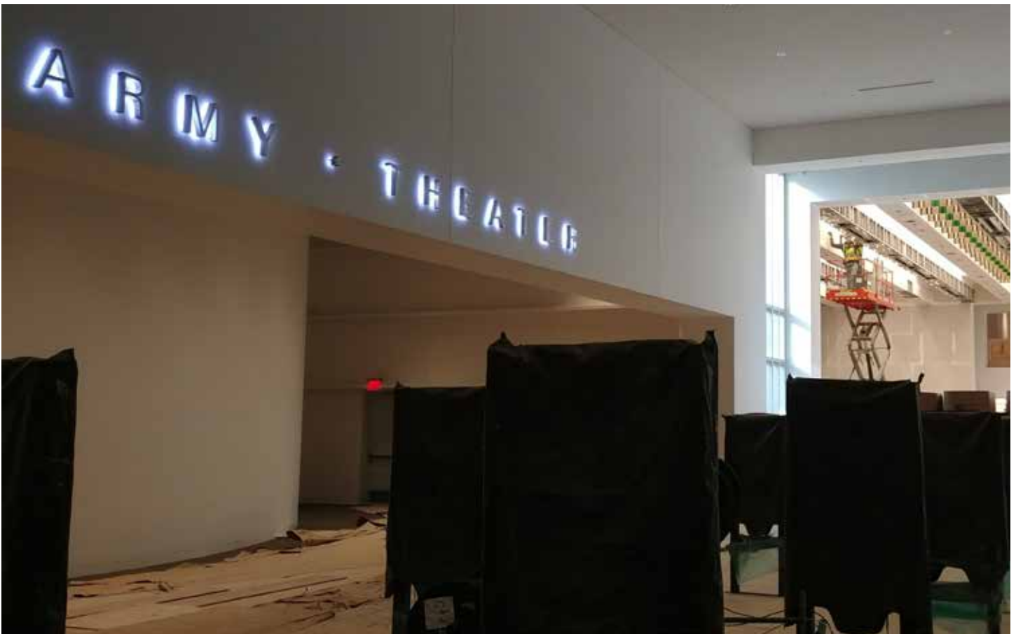
Soldiers Stories Gallery and Army Theater-November 2018