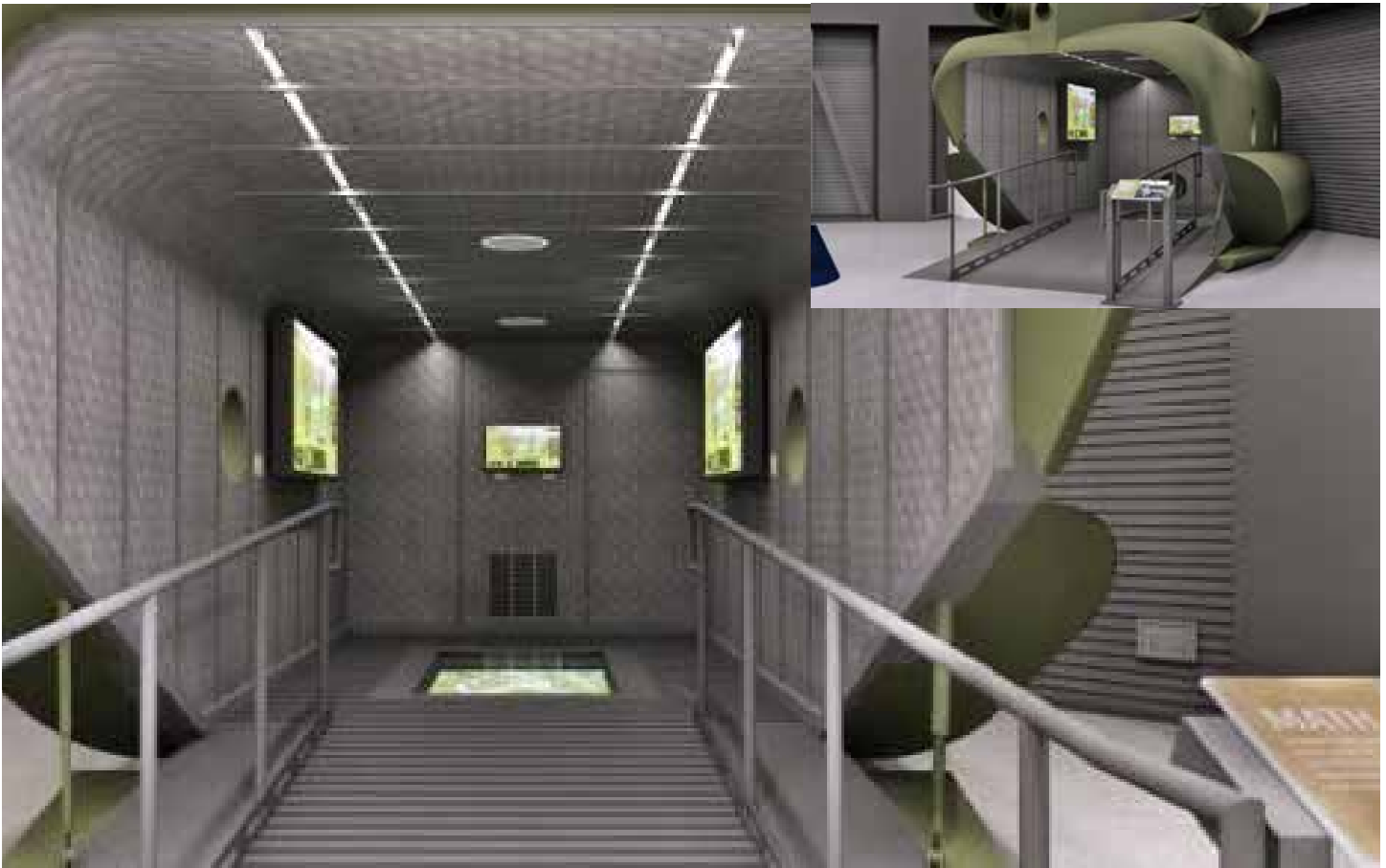
Finished Move Out (Math) Station Conceptual Rendering-ELC