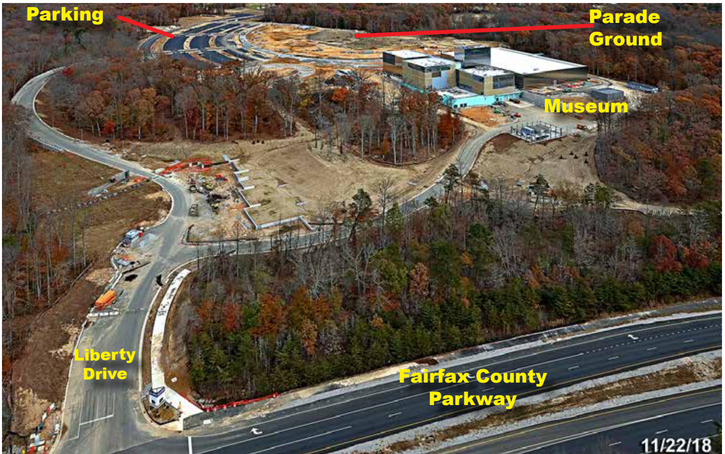
Aerial Photo of the National Army Museum Site-November 2018