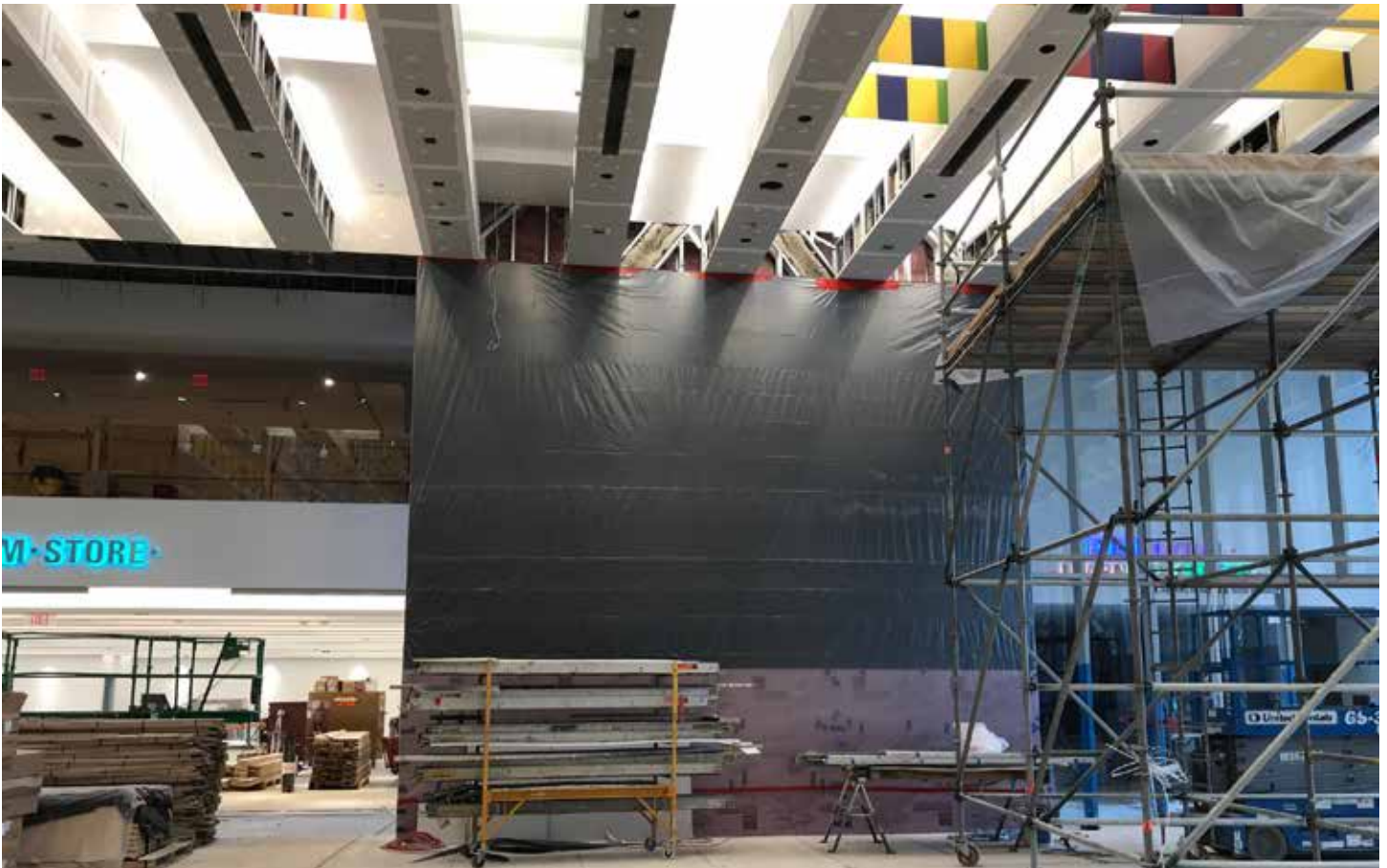
Donor Wall-November 2018