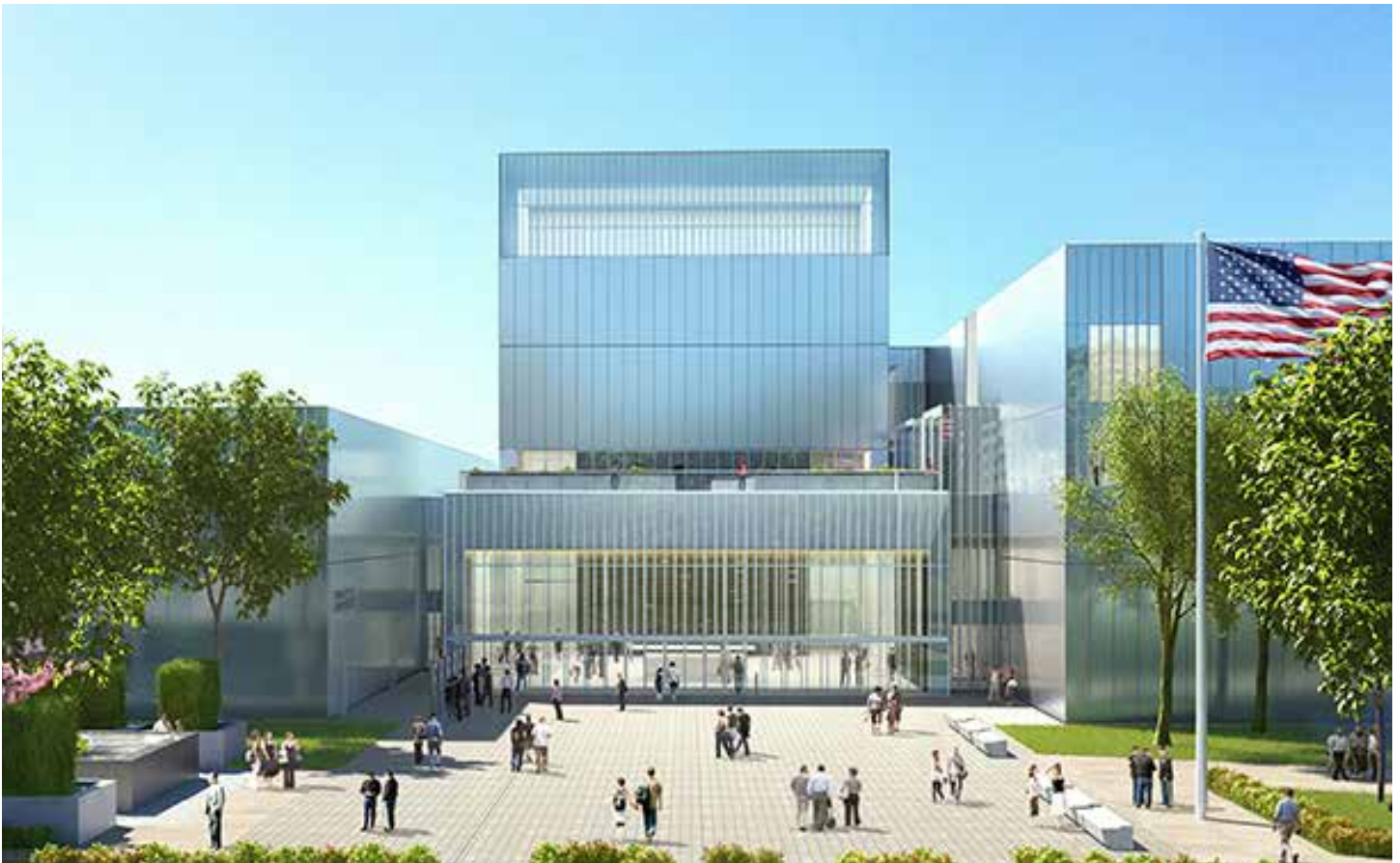
Finished Museum Entrance Conceptual Rendering