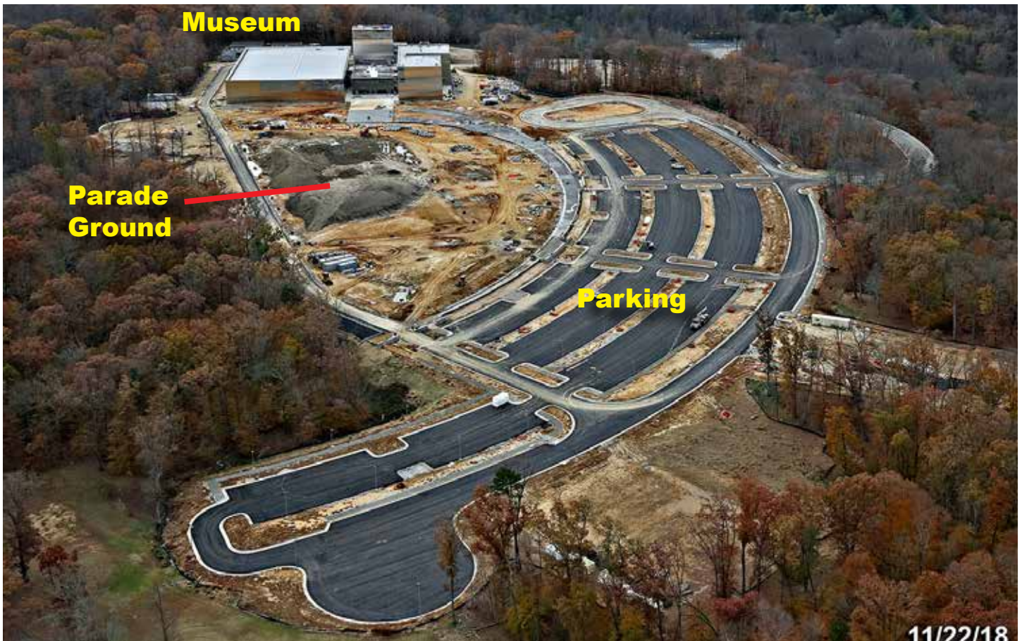
Aerial Photo of the National Army Museum Site-November 2018