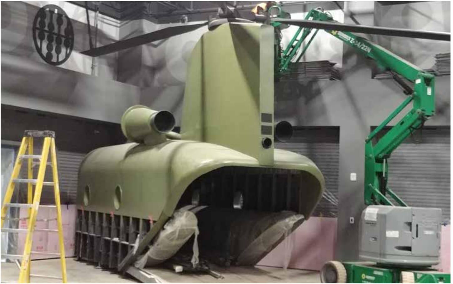
Move Out (Math) Station-ELC November 2018