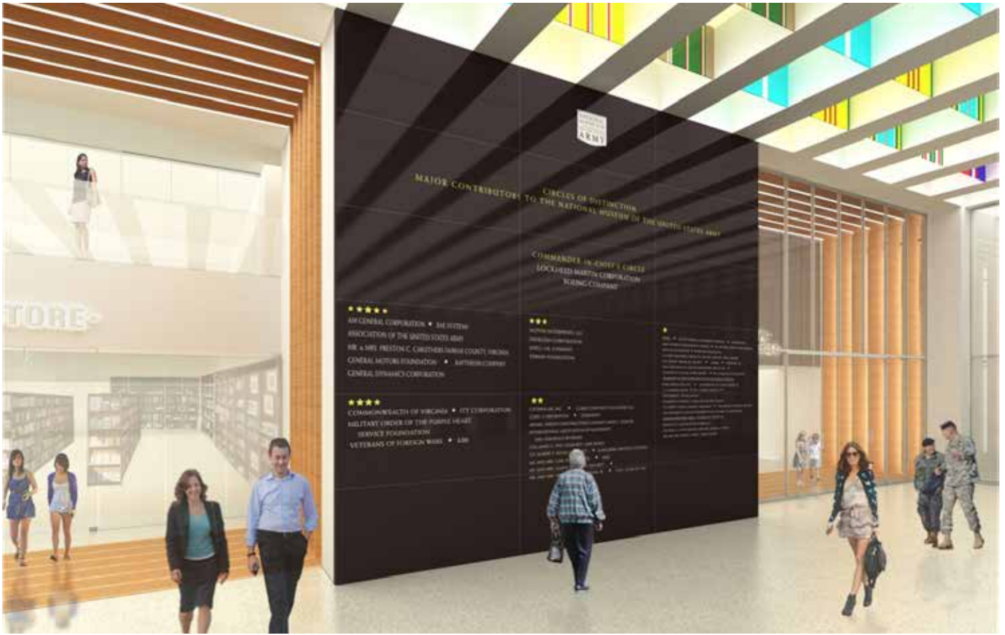
Finished Donor Wall Rendering—Flanked by Gift Shop (left) and Experiential Learning Center (right)