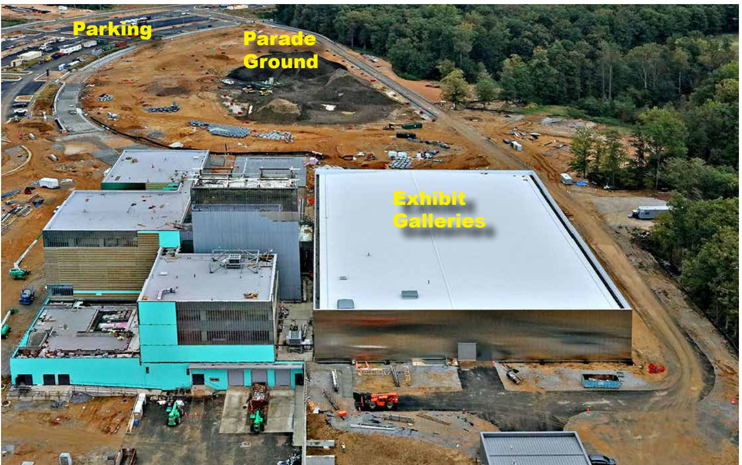
Aerial Photo of the National Army Museum Site-October 2018