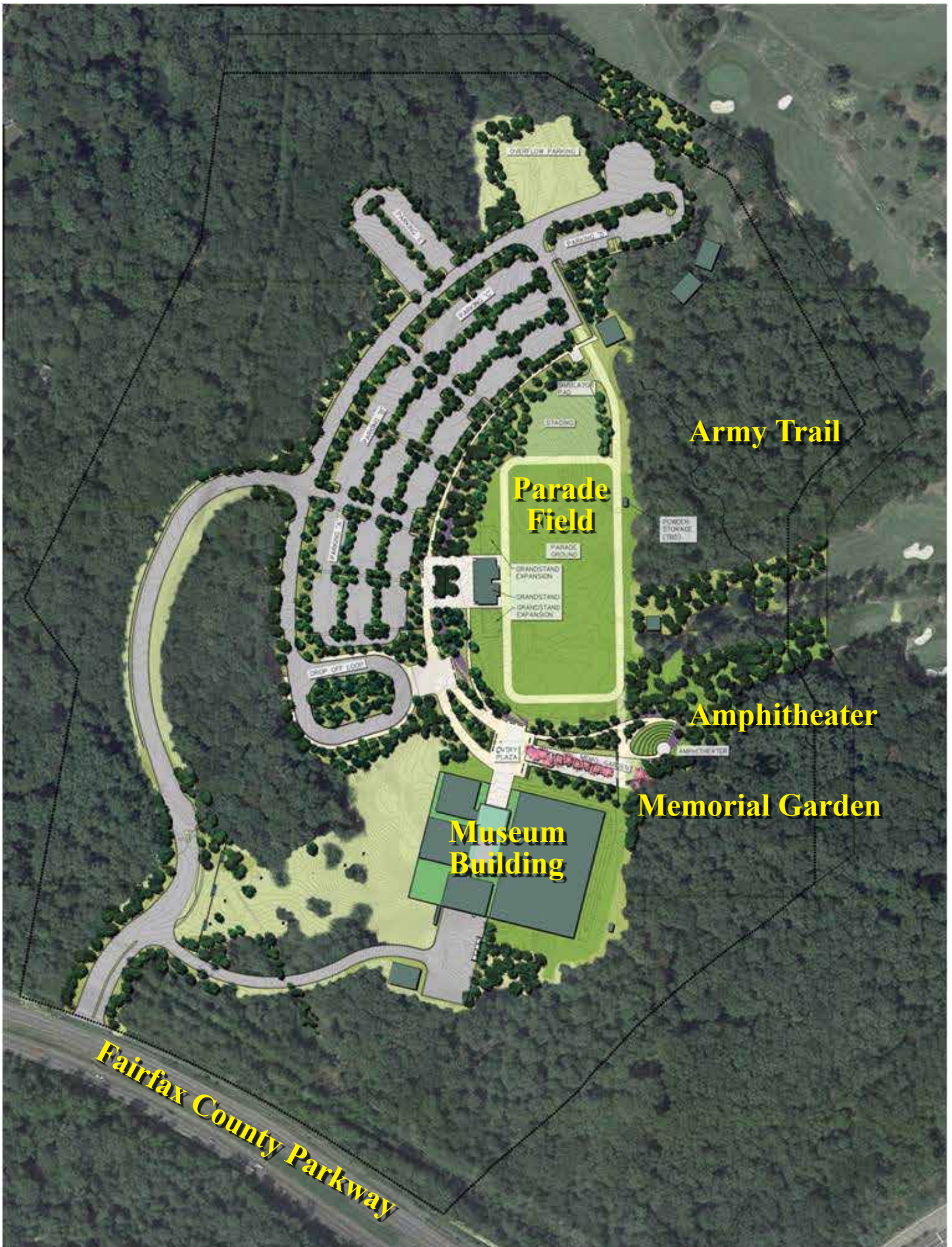
National Museum of the United States Army conceptual Site Plan.