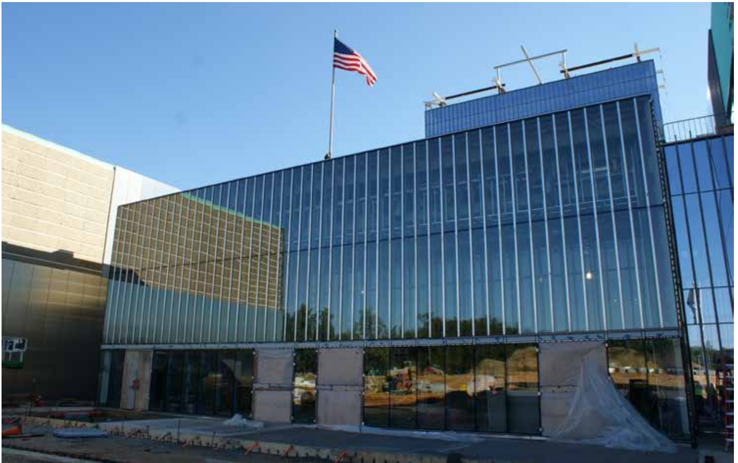
Museum Entrance-October 2018