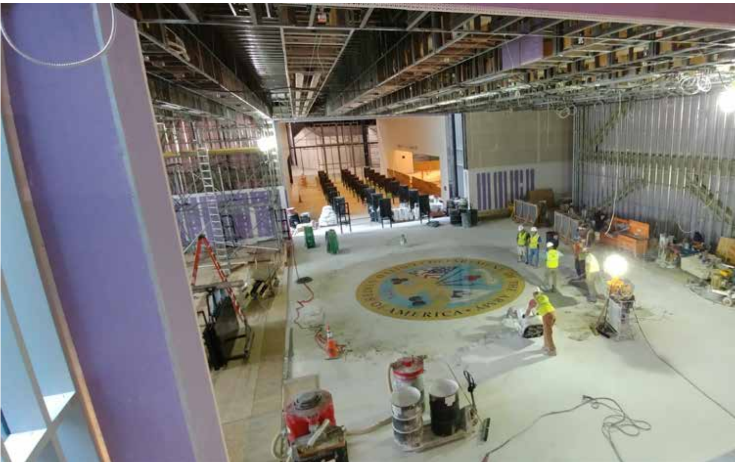
Army Seal in Lobby with Army Theater and Soldiers Stories Gallery in background-October 2018