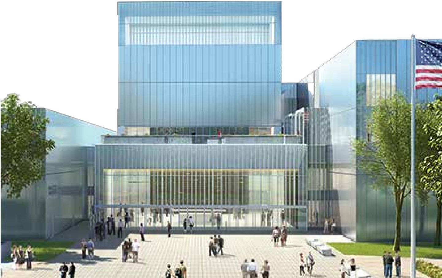
Finished Museum Entrance Conceptual Rendering