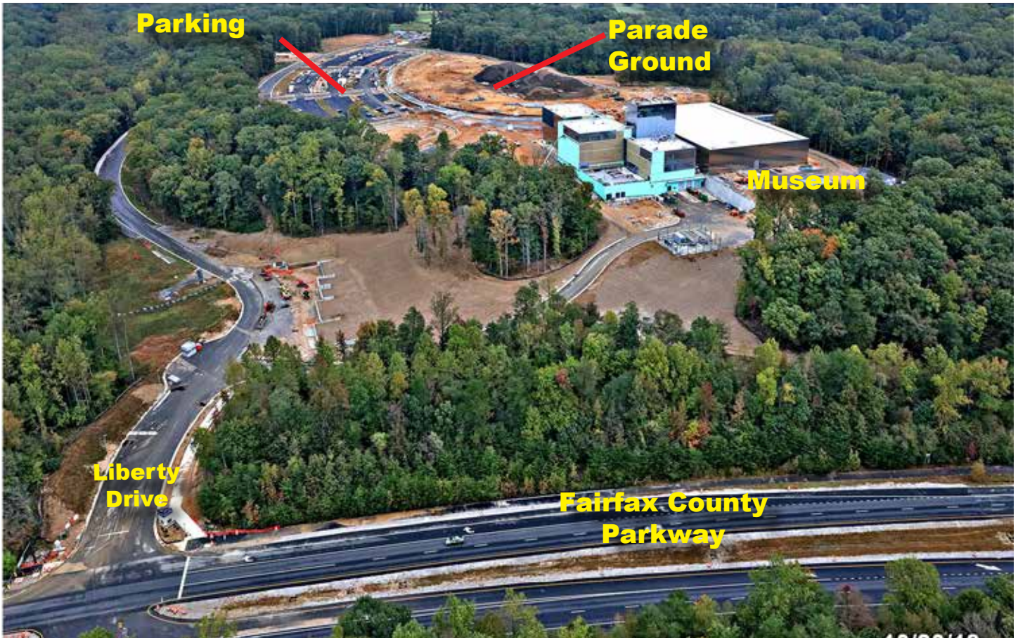
Aerial Photo of the National Army Museum Site-October 2018