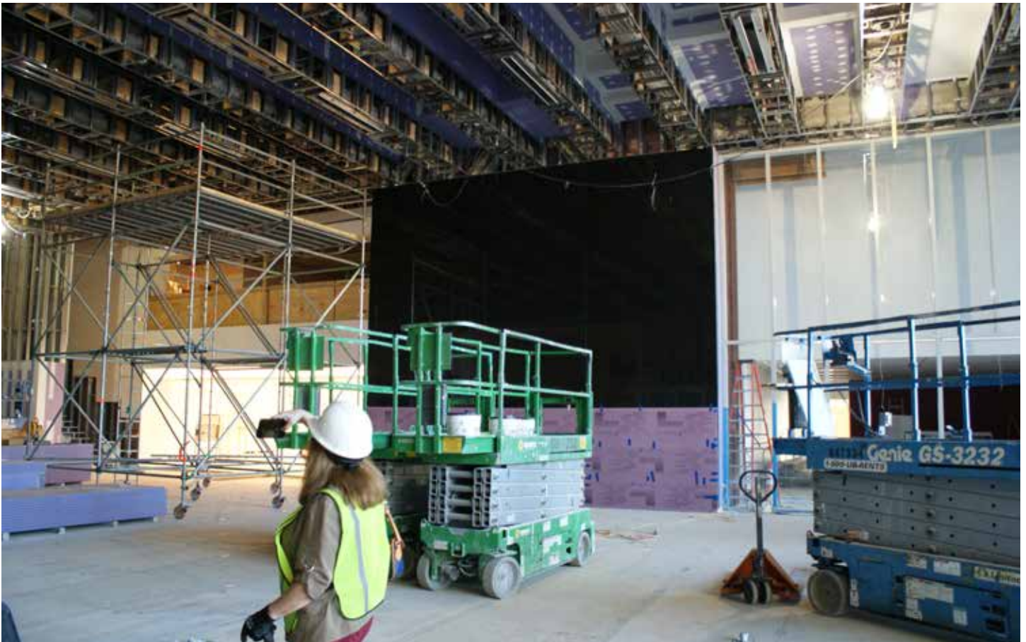
Donor Wall-October 2018