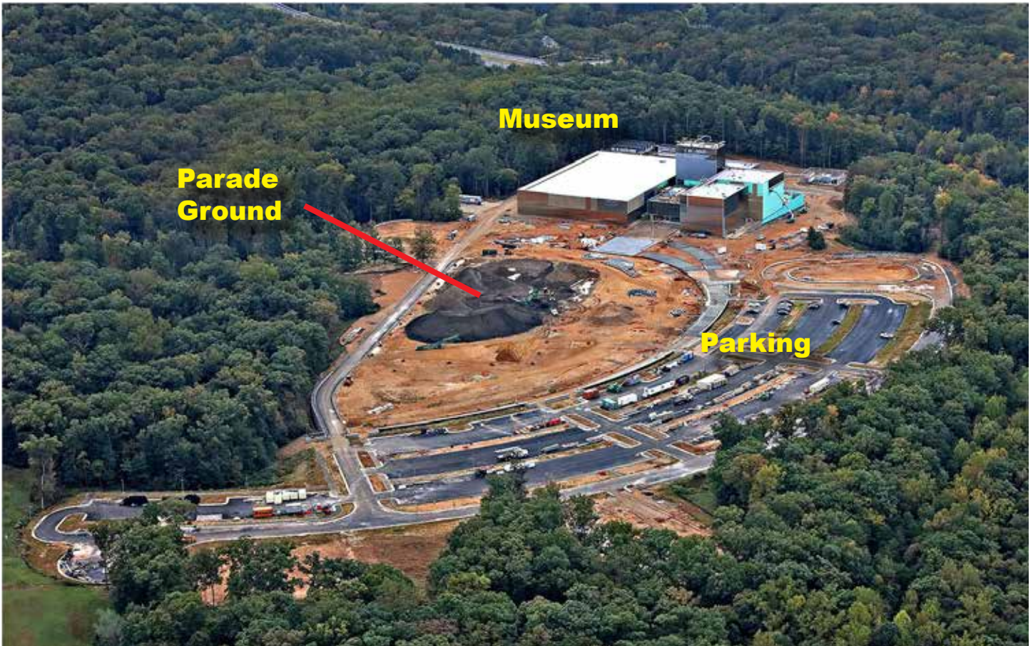
Aerial Photo of the National Army Museum Site-October 2018