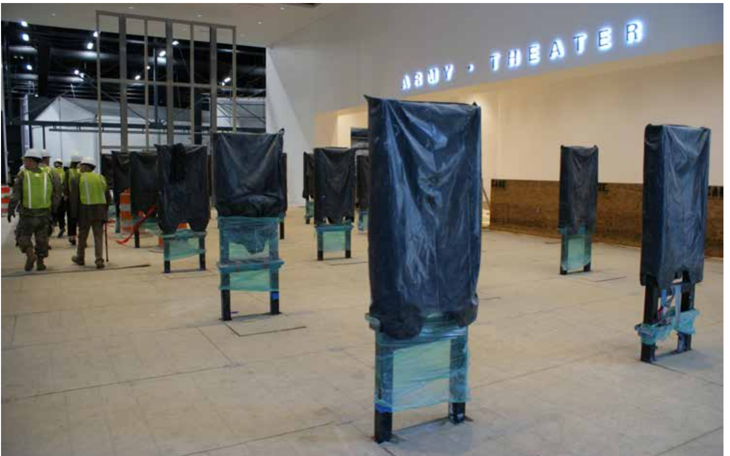
Soldiers Stories Gallery and Army Theater-October 2018