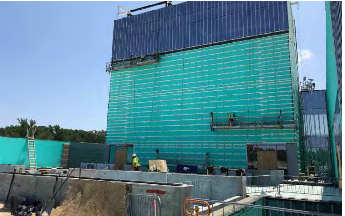
Medal of Honor Terrace-July 2018