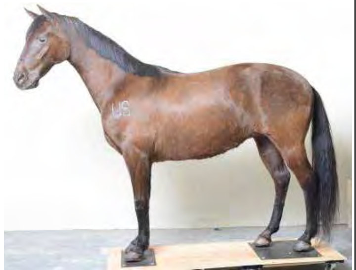
Cast Figure of the Buffalo Soldier’s mount from the Preserving the Nation: Westward Expansion Exhibit

The “Late Indian Wars” section of the display will demonstrate how the Army returned to the western frontier to protect settlers following the Civil War. Within the display, visitors will see a life-size representation of a Buffalo Soldier in field dress wearing his overcoat and mounted on his horse. Interpretive panels will tell the stories of such Soldiers. Visitors will also learn about the Army’s role in establishing forts and posts. In addition, the displays will tell of the work of the Army to