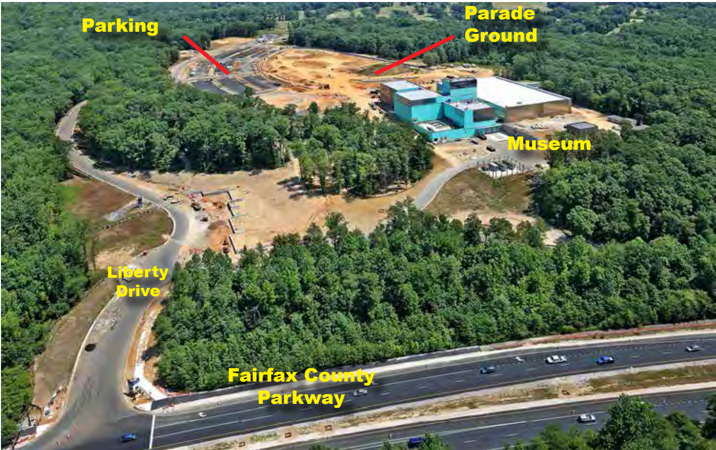
Aerial Photo of the National Army Museum Site-July 2018