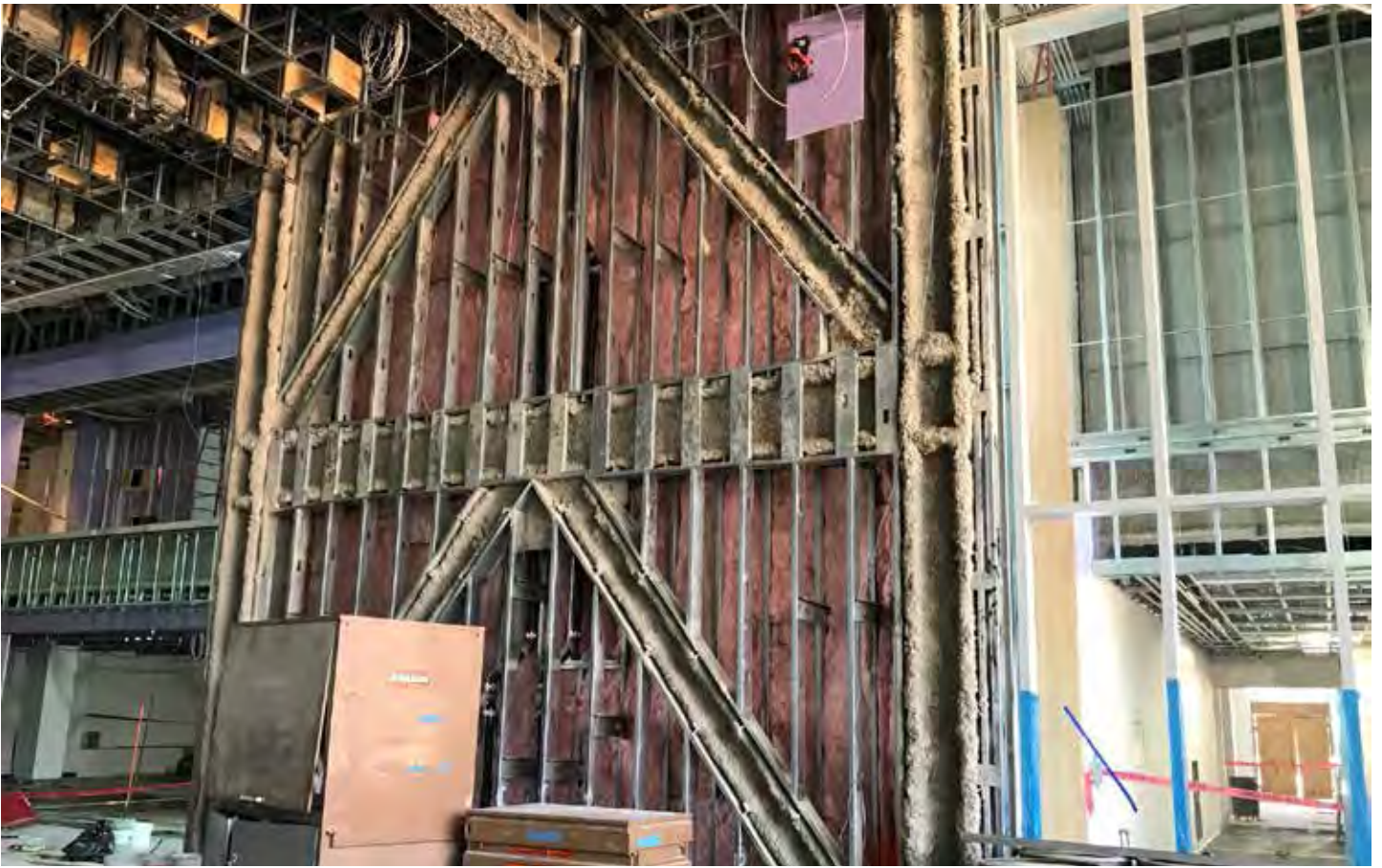
Donor Wall-July 2018