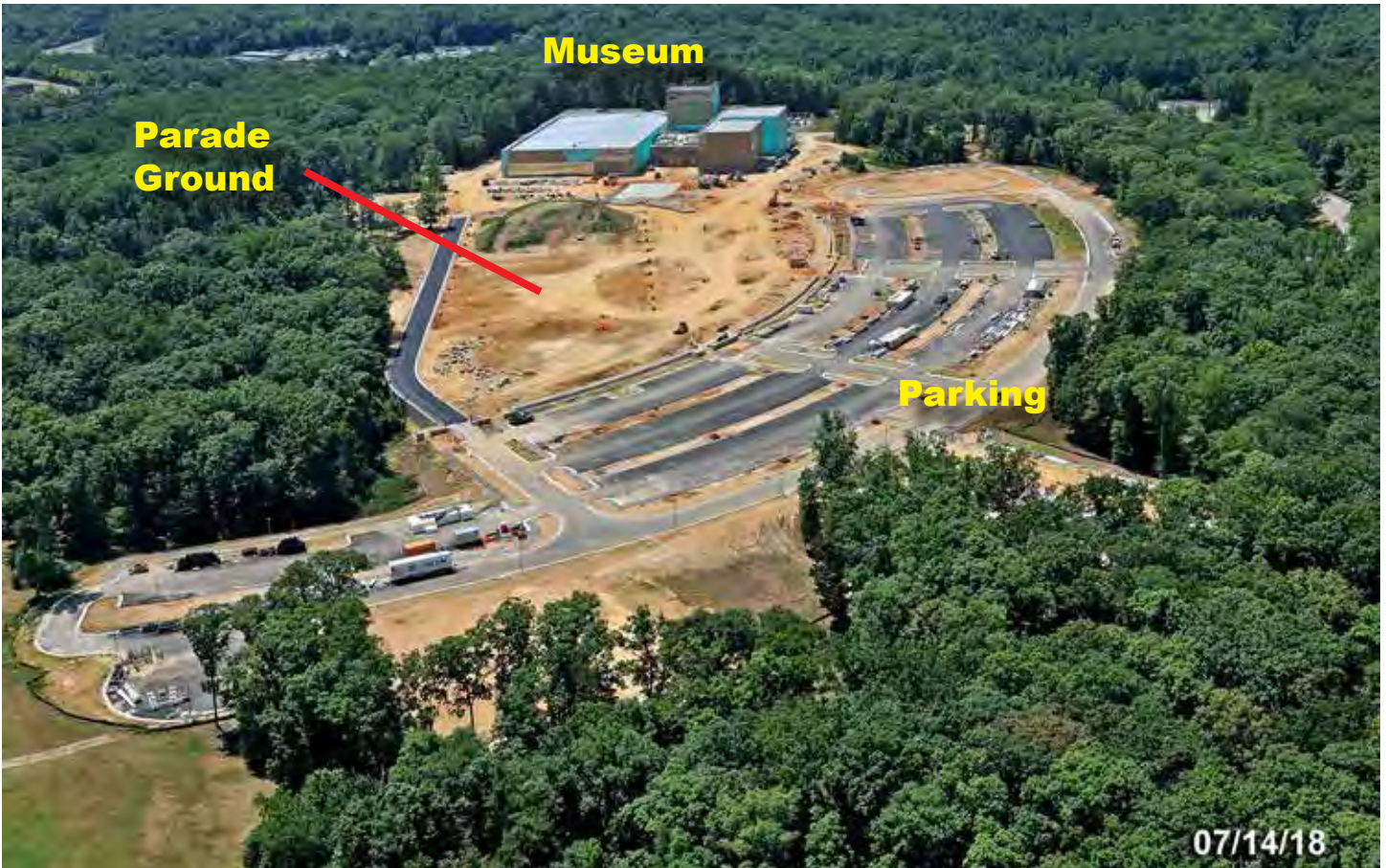
Aerial Photo of the National Army Museum Site-July 2018