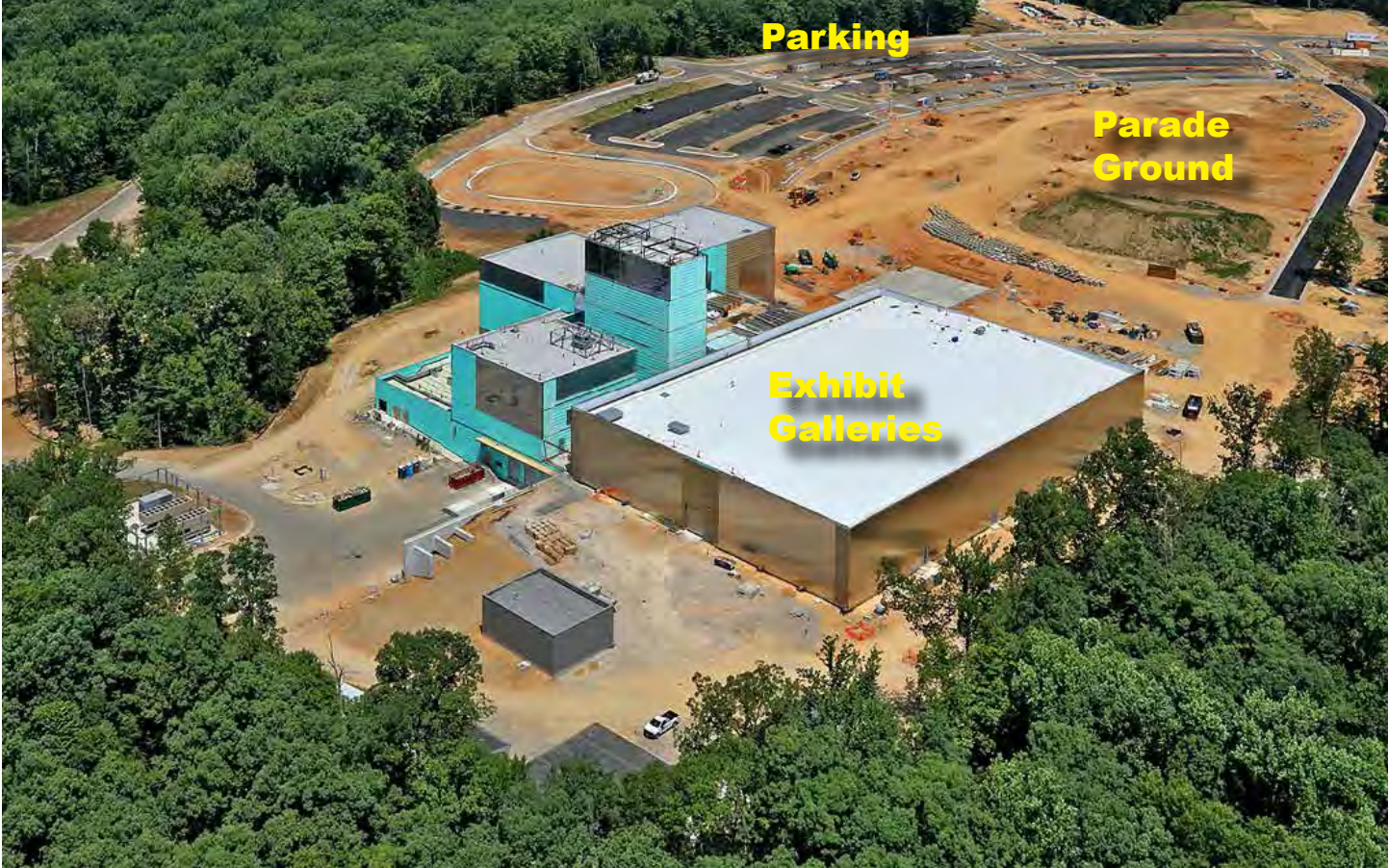
Aerial Photo of the National Army Museum Site-July 2018