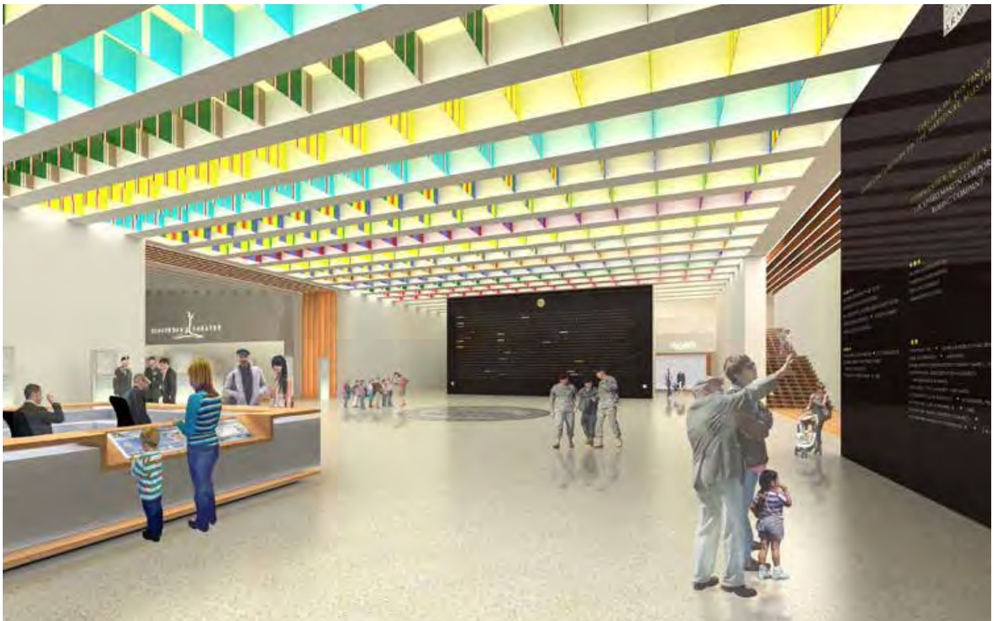
Finished Lobby Rendering