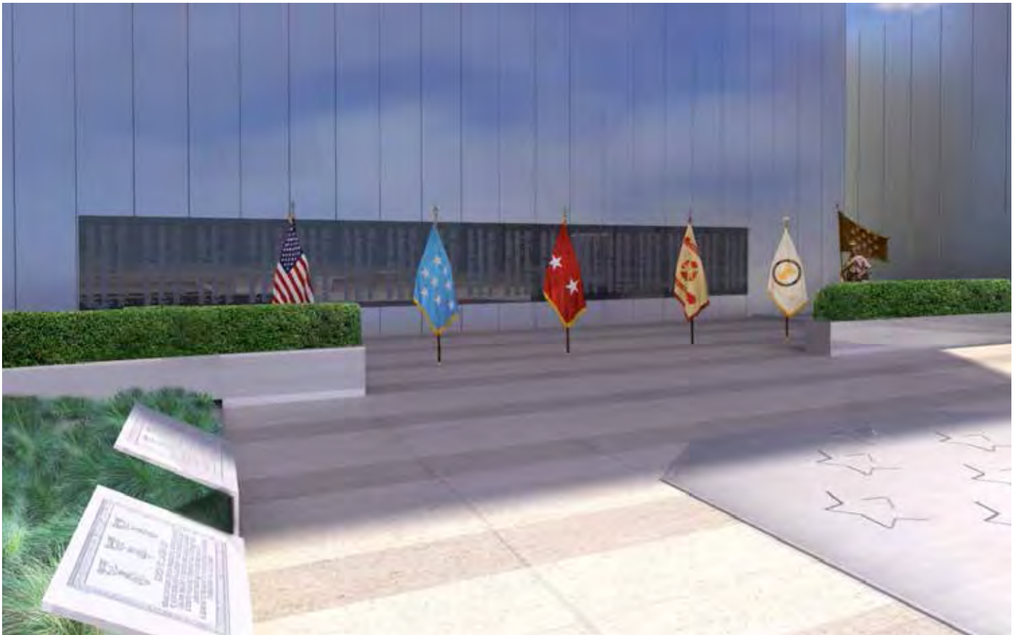
Finished Medal of Honor Terrace Rendering