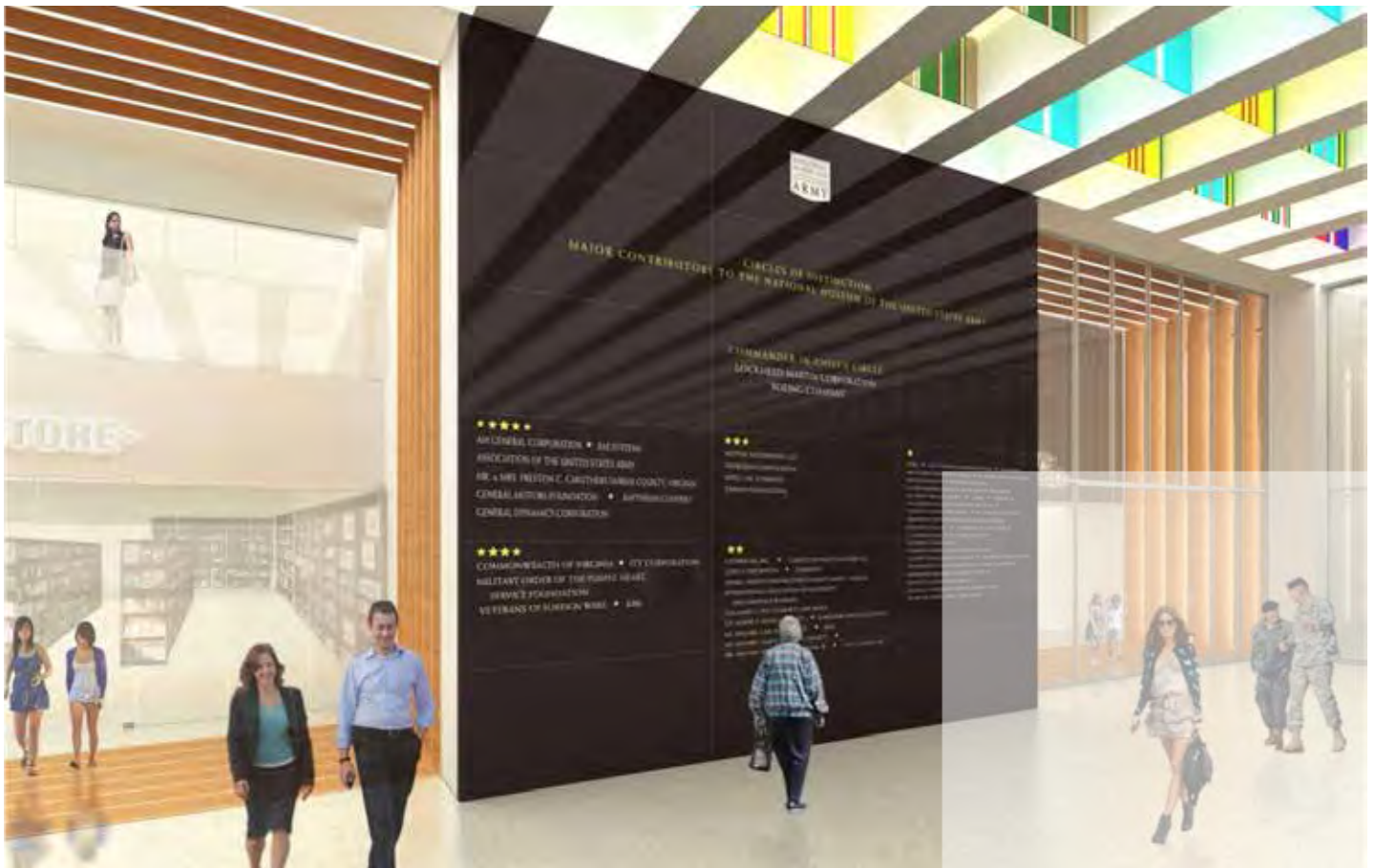
Finished Donor Wall Rendering—Flanked by Gift Shop (left) and Experiential Learning Center (right)