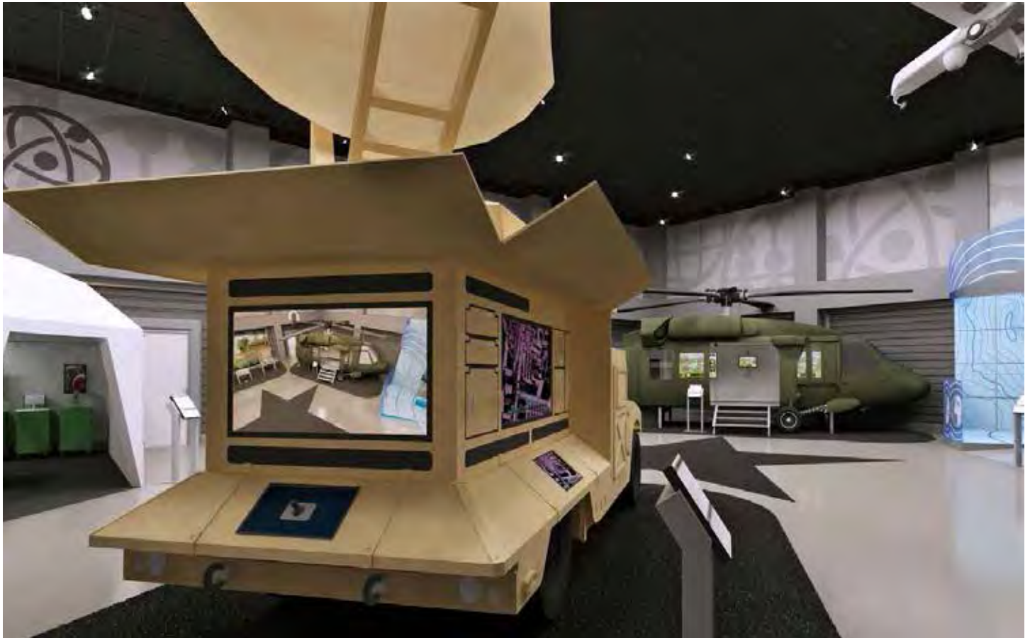
Finished Experiential Learning Center Training Center Rendering