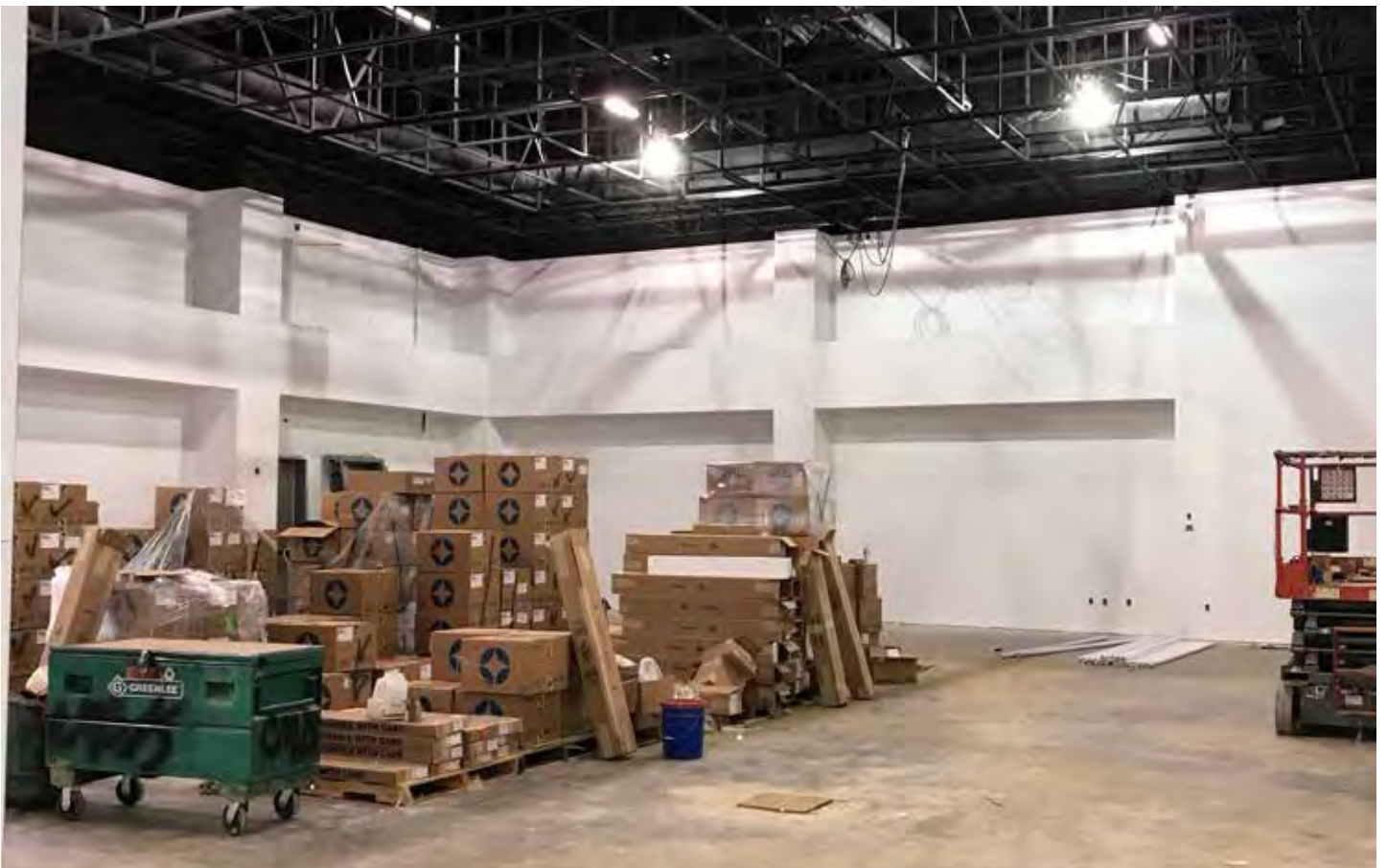
Experiential Learning Center (sponsored by Lockheed Martin Corporation) Training Center-July 2018